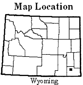
Map 3: Unit 3 (Bear Creek - West)