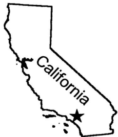
Area of Detail